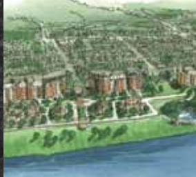
② COVINGTON RIVERFRONT EAST AND CENTER