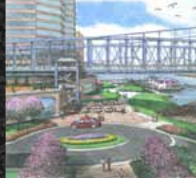
③ NEWPORT RIVERFRONT WEST