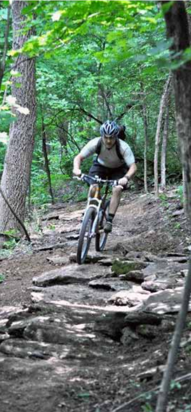
① LUDLOW RIVERFRONT